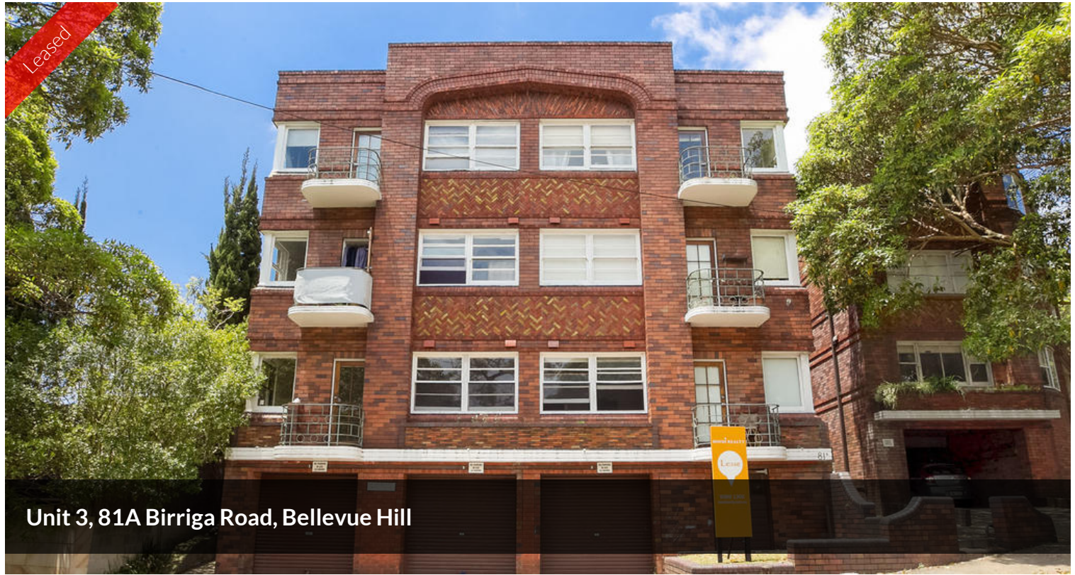
Unit 3, 81A Birriga Road, Bellevue Hill