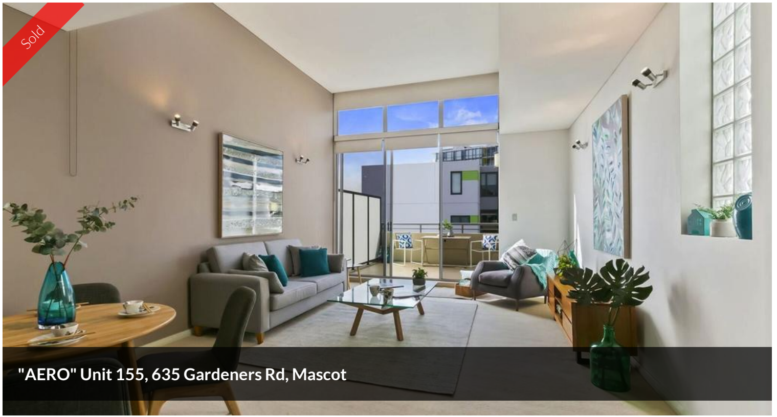
"AERO" Unit 155, 635 Gardeners Rd, Mascot