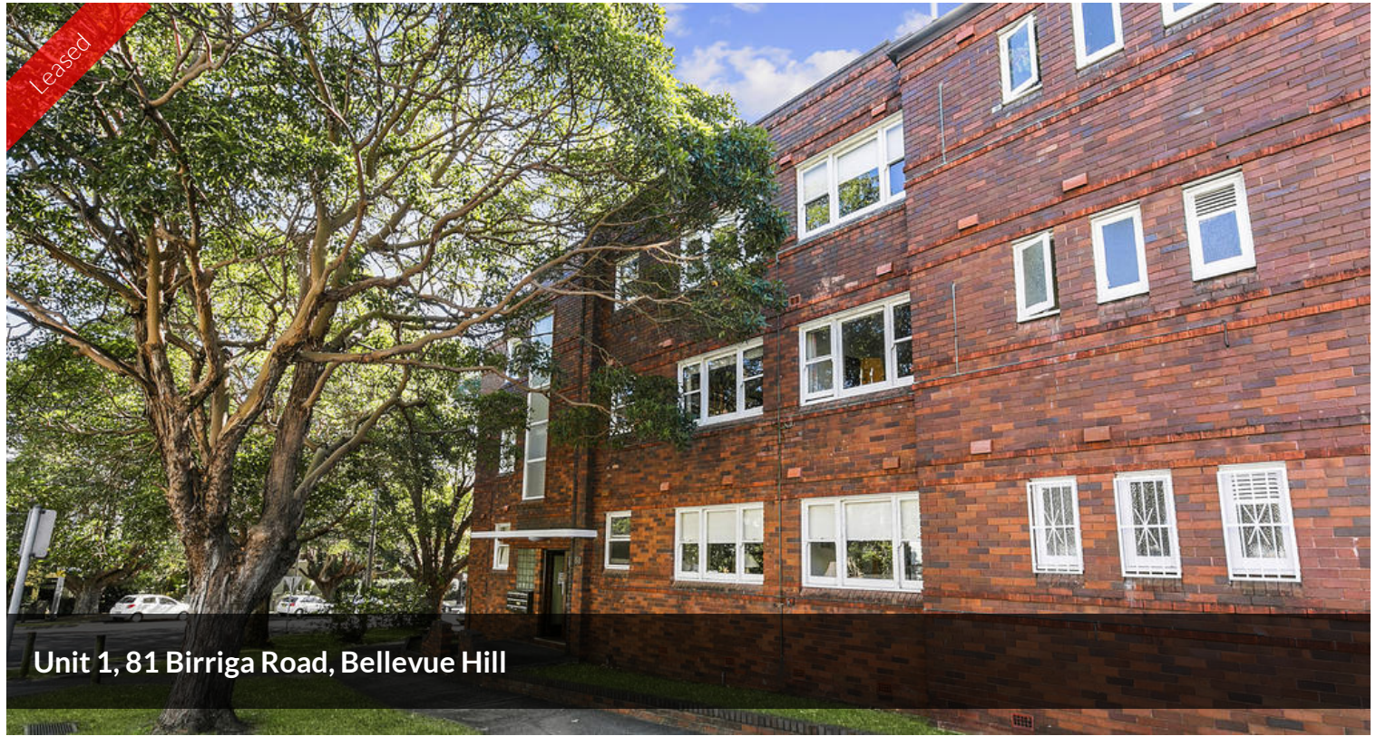
Unit 1, 81 Birriga Road, Bellevue Hill