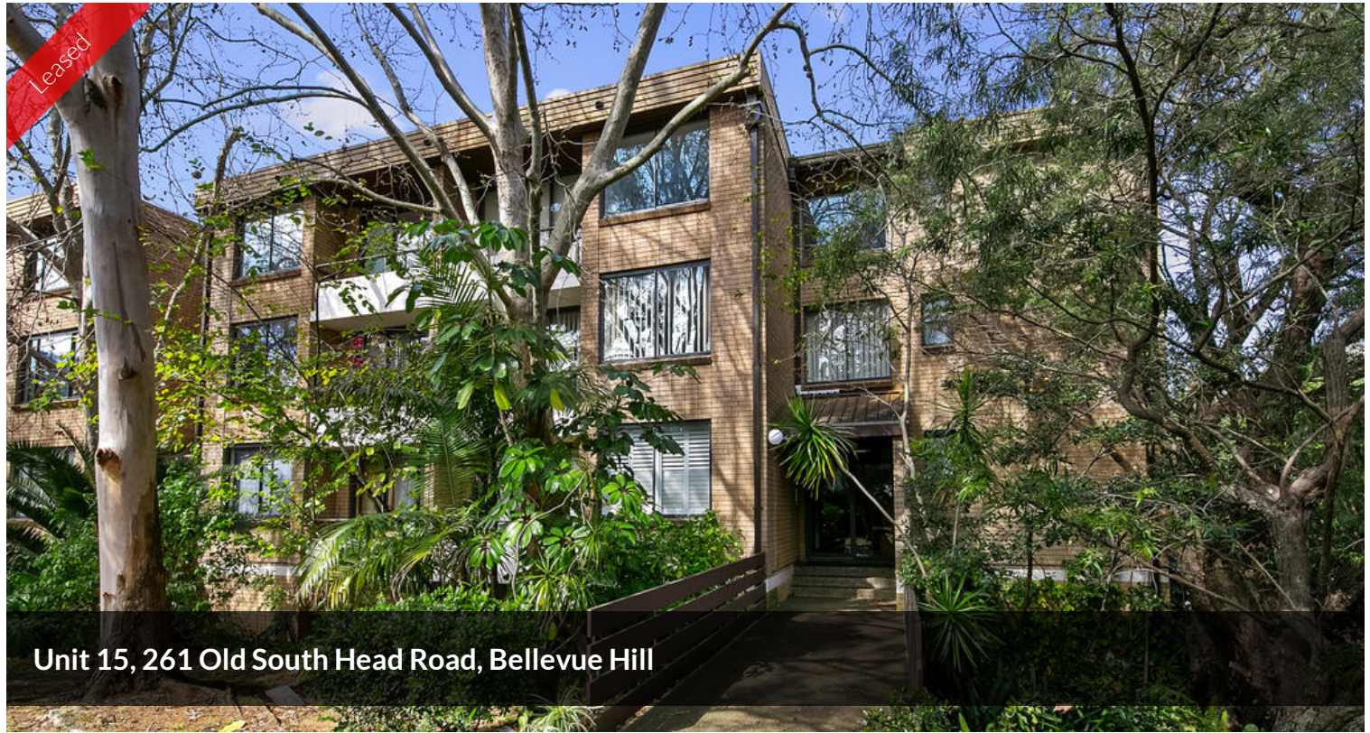
Unit 15, 261 Old South Head Road, Bellevue Hill