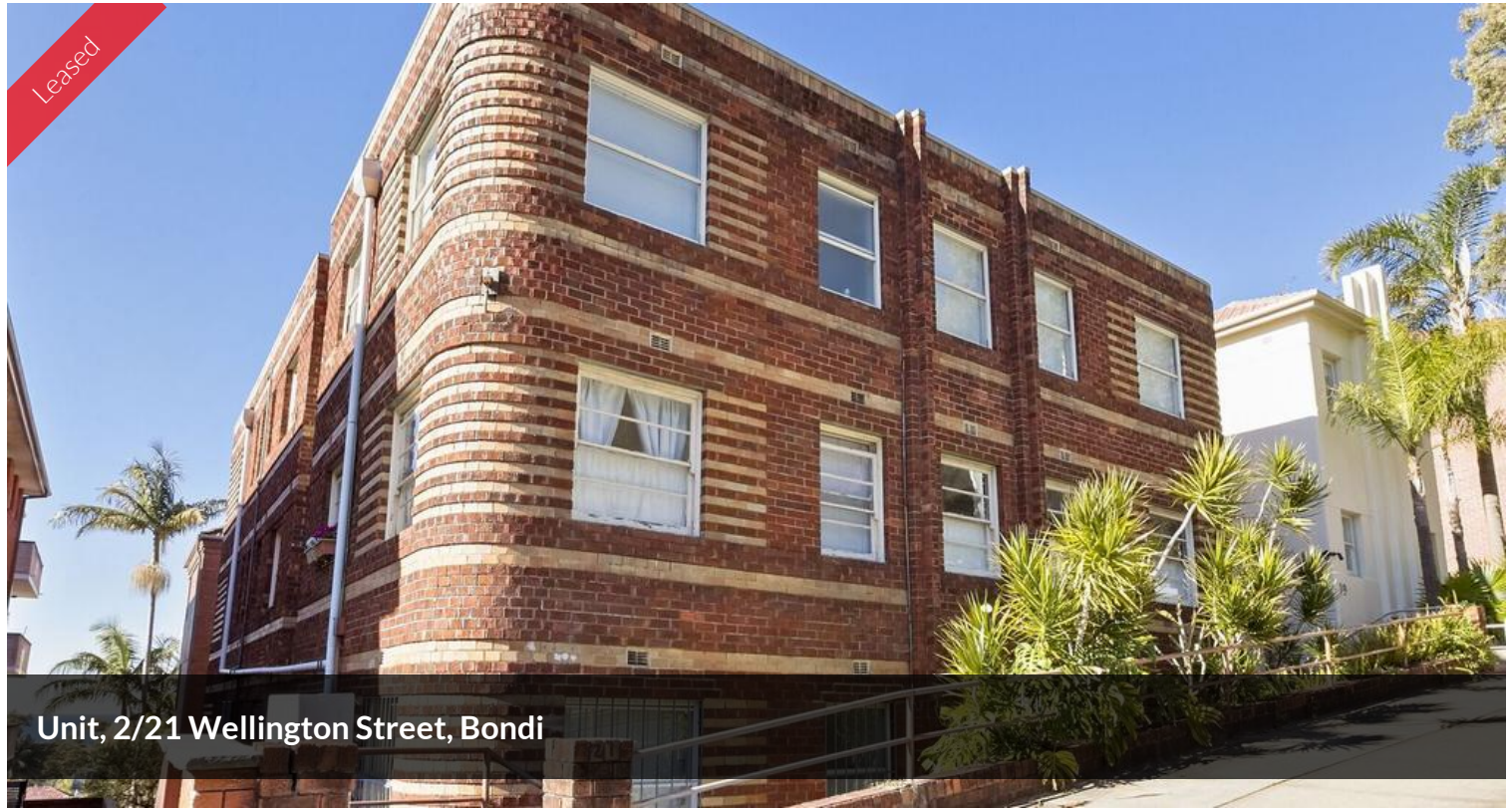
Unit, 2/21 Wellington Street, Bondi