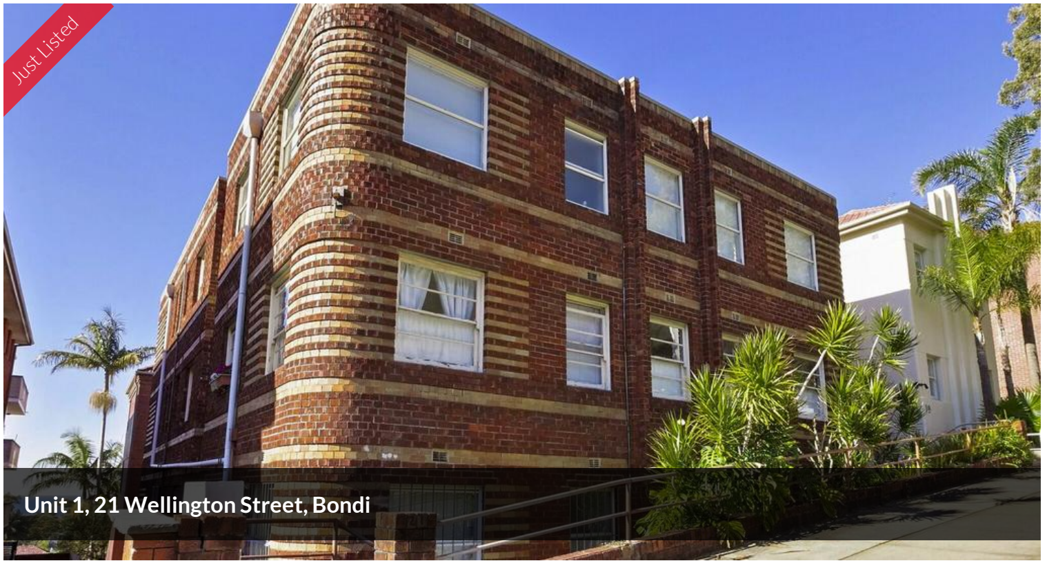
Unit 1, 21 Wellington Street, Bondi