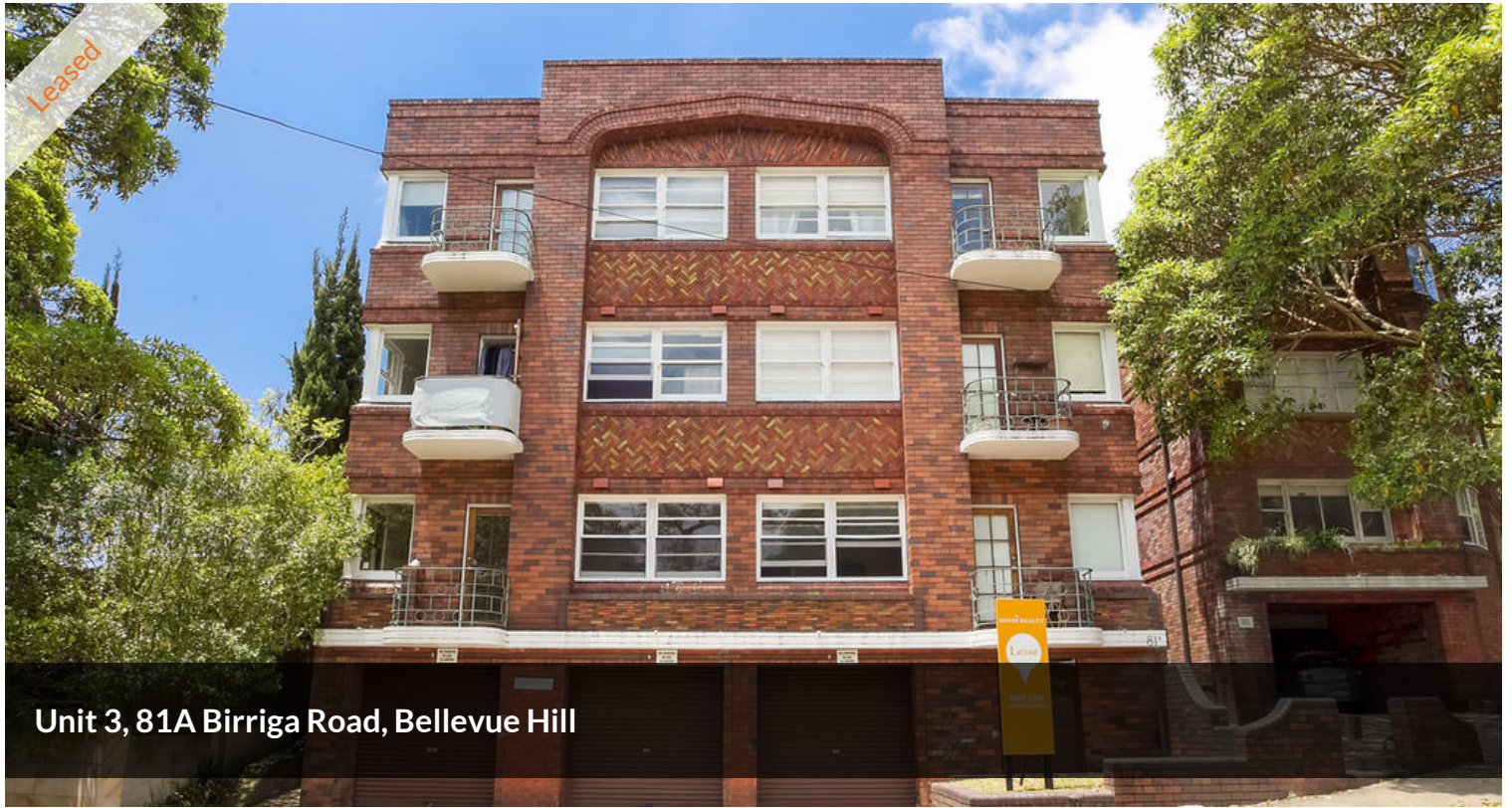
Unit 3, 81A Birriga Road, Bellevue Hill